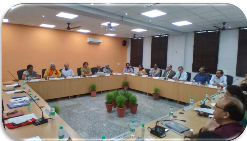
Meeting of the Research Advisory Council